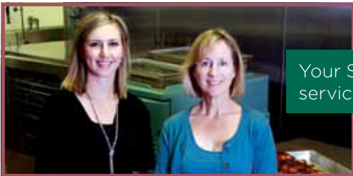
Your SDG&E food service team.