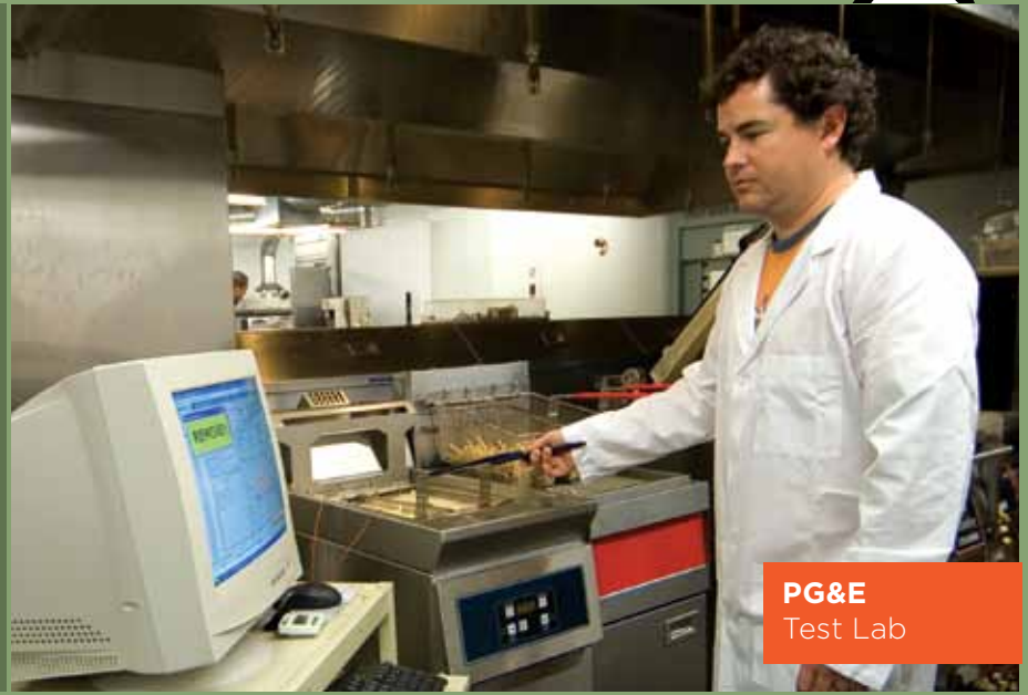
PG&E Test Lab

Engineers at the test labs of SoCalGas, SCE, and PG&E use American Society for Testing and Materials test methods to test the operating efficiency and qualifications of a variety of foodservice equipment for the California Statewide Rebate Program. Choosing qualified equipment can help you save energy and money.