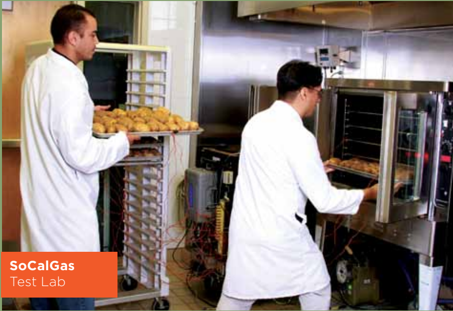
SoCalGas Test Lab