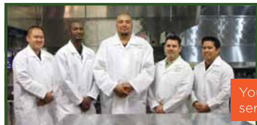
Your SCE food service team.