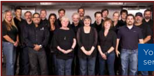
Your PG&E food service team.