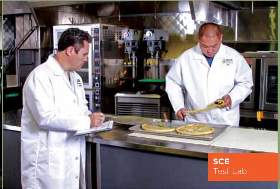
SCE Test Lab

To register, visit: Southern California Gas Company socialgas.com/business | Pacific Gas & Electric fishnick.com Southern California Edison sce.com/energycenters | San Diego Gas & Electric sdge.com/foodservice