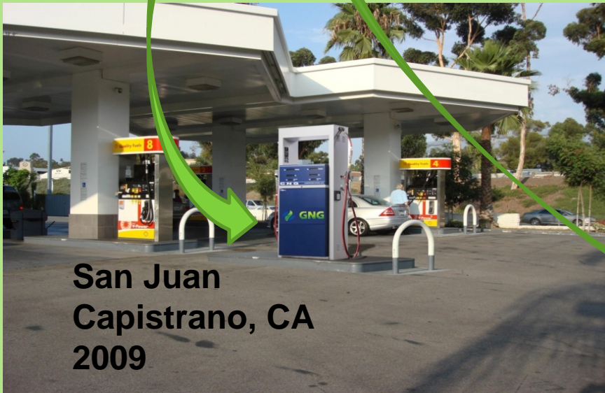
San Juan Capistrano, CA 2009