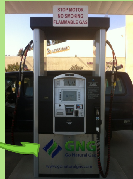
Moreno Valley, CA 2011