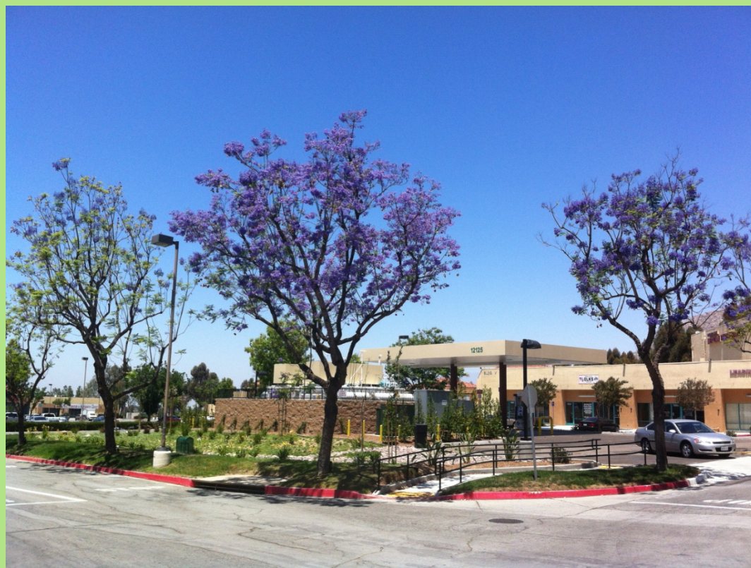
Canyon Springs Shopping Center I-60 & I-215 at Day Street Moreno Valley