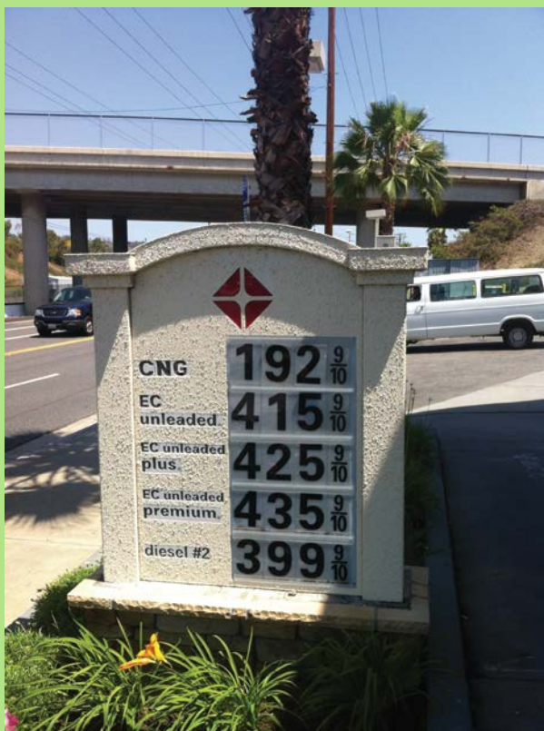
ARCO AM/PM I-5 at Avery San Juan Capistrano, CA