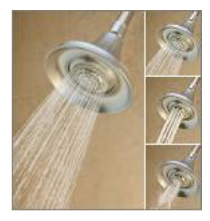
Single showerhead fixture -Kohler

This type of showerhead may have a single setting or more than one setting. Settings often include more and less focused sprays and a pulsating spray. The photo below shows the showerhead selected by Holiday Inn based on its performance in terms of coverage and pressure.