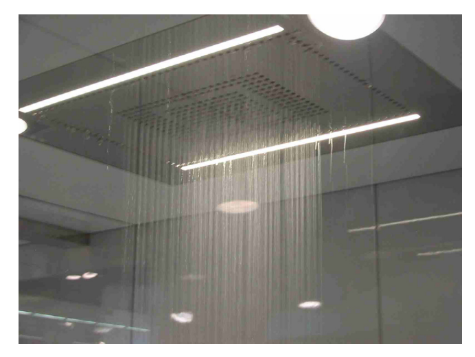
Rain system

As shown in the photograph below, rain systems simulate rain by allowing water to fall from an overhead fixture.