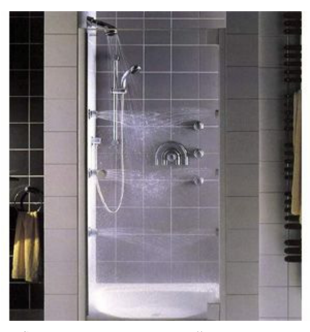
Shower panels

These are designed to spray water from more than one location having more than one showerhead. They may operate sequentially or as the photo shows below all at one time. Some are designed for the homeowner to replace an existing single pipe fixture and some are designed to be professionally installed with all piping behind the walls.