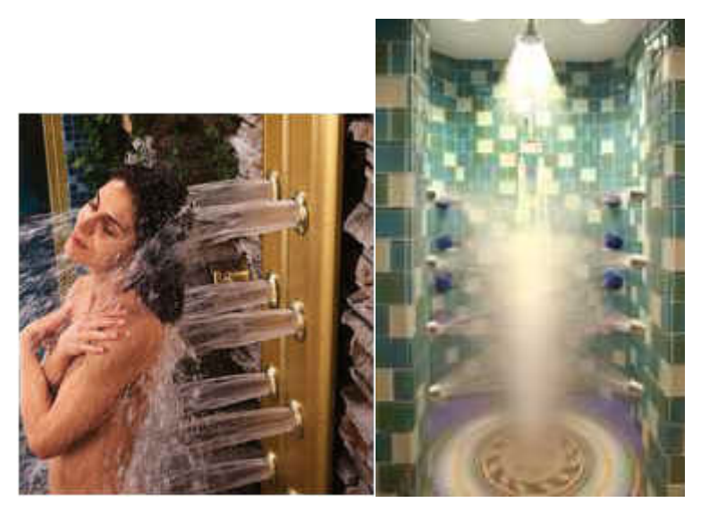
Body spas – sources: Kohler Body Spa Systems & Santa Cruz Sentinel, March 21, 2005

The number of showerheads that are active can sometimes be controlled by the user via controls or may be set to automatically vary the spray pressure and temperature.