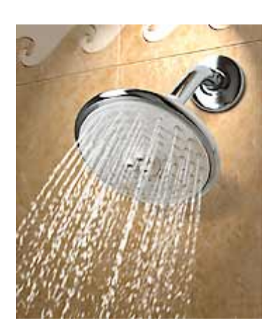
Cascading showerhead-Consumer Reports, Hansgrohe Raindance

These are also referred to as "rainshower" and "downpour" type fixtures. They often are mounted overhead such that the water drops straight down. They typically give a softer spray and have diameters of 6 to 8 inches. They are less likely to have more than one spray setting. The model shown below has 80 spray nozzles.