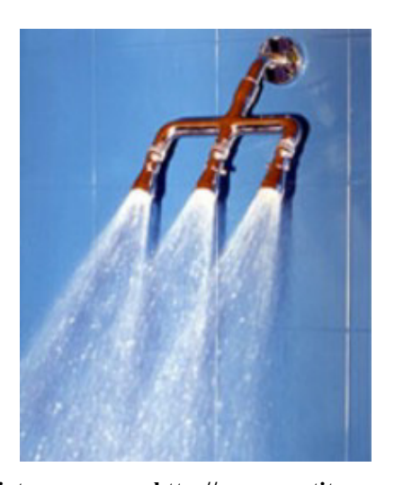
Multiple showerhead fixture

These fixtures may have two or more spray nozzles connected to one pipe. They can easily replace a single head fixture.