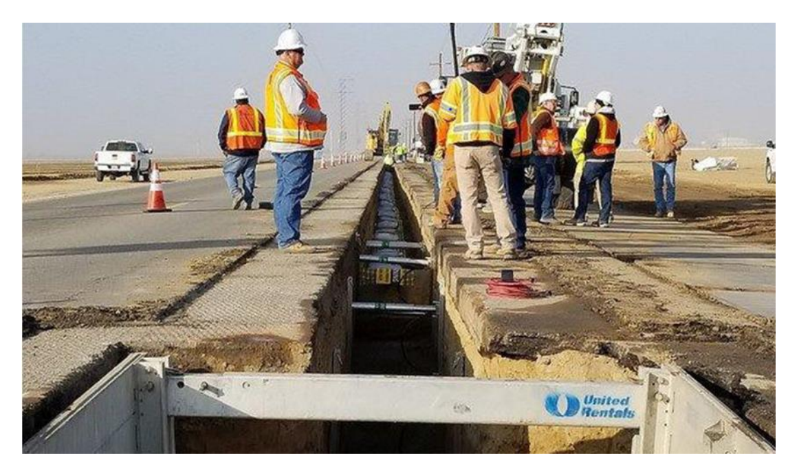
Work gets underway on laying fiber optic cable

compressors, turbines, underground storage, wellheads and other skid assemblies that may also include linear (pipe) and critical auxiliary components. Critical auxiliary components include any component that is critical to the function of high pressure PVFE and would not be able to function without, which may or may not be pressure bearing and may host other mediums (e.g., oil, water, glycol, and electricity) besides natural gas.